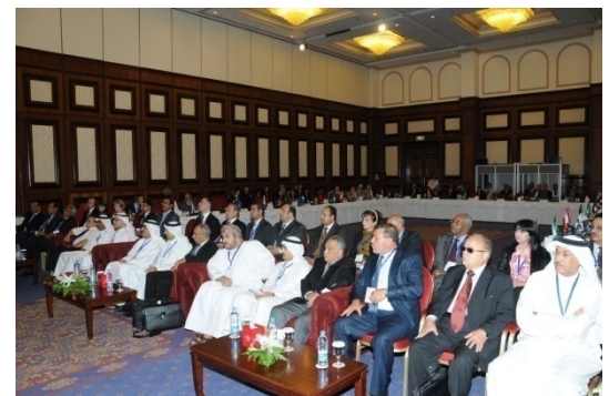
Photos of the participants in the 9 th Plenary

MENAFATF held its 9 th Plenary from 18-20 May 2009 in Manama, Bahrain, in the presence of AML/CFT experts from the member countries and observers, which discussed the topics listed in its work program and took some decisions; the most important of which are: