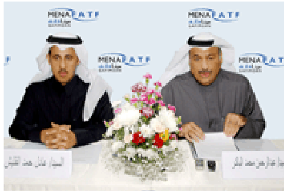
(A Picture of the press conference held in this regard)

In its assertion for the MENAFATF support, the headquarters agreement was ratified and became applicable in 2009 whereby it has been approved by both the Shura Council and the Parliament, and ratified by the King of Bahrain; he has issued as well law No. (5)/2009 to ratify the agreement on March 26, 2009 and was published in the official gazette on April 2, 2009.