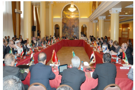
Photos of the participants in the 10 th Plenary

The MENAFATF held its 10 th Plenary from 9-11 November 2009 in Beirut, Lebanon, in the presence of AML/CFT experts from the member countries and observers. The Plenary discussed the topics listed in the agenda and took some decisions, the most important of which are: